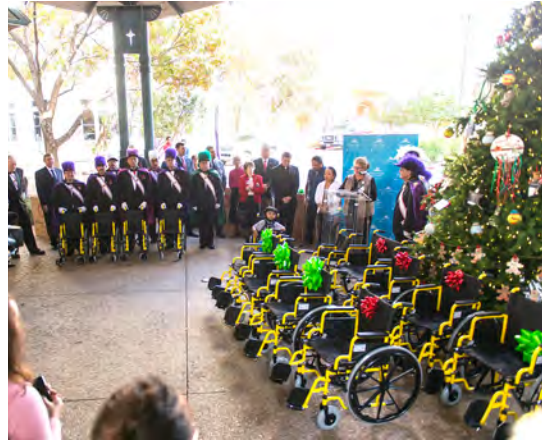
Wheelchair distribution in San Antonio