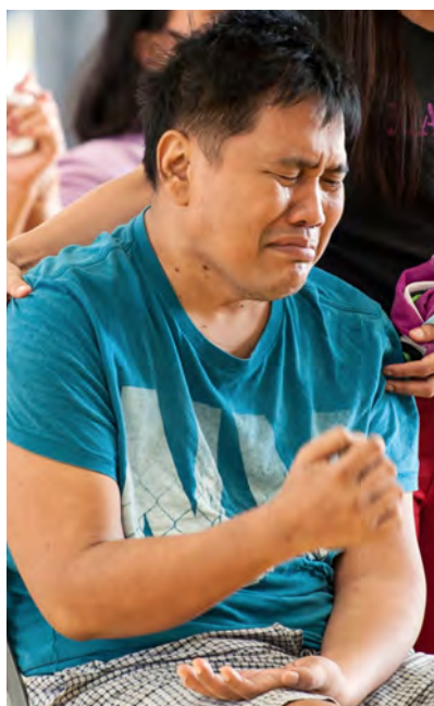
Gratitude in Cebu City