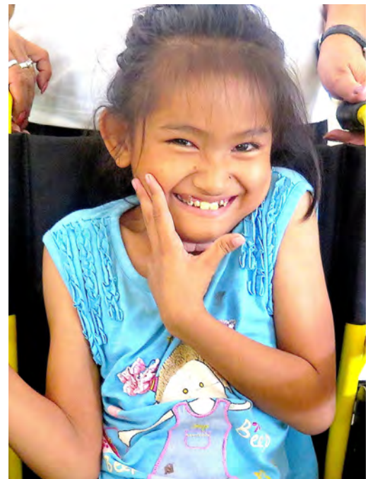
Salve, 7, is so happy