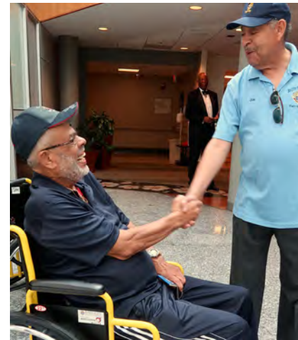
Veterans at the Washington, DC VA