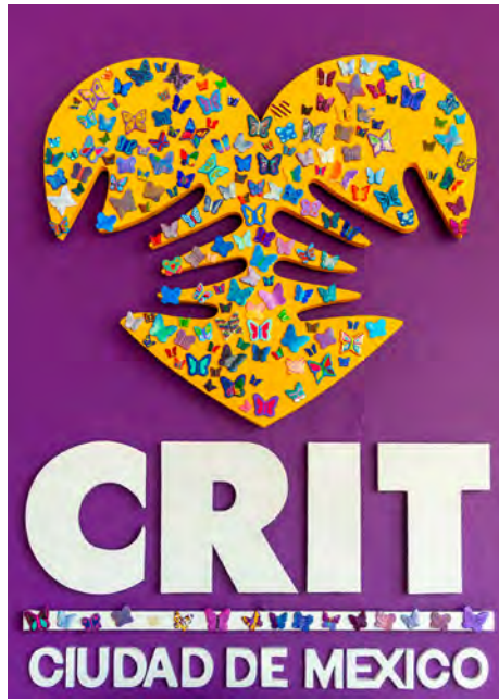
Changing children’s lives

Donating a wheelchair to a child in Mexico is a blessing for both the recipient and the donor.