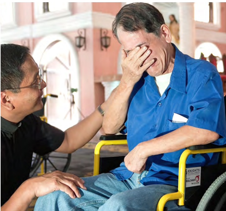
Tears of joy and relief