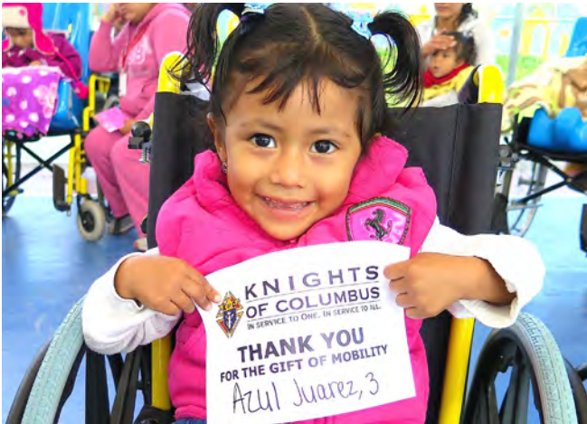
Gift of an angel