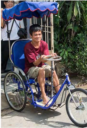
Tricycle push/pull wheelchair