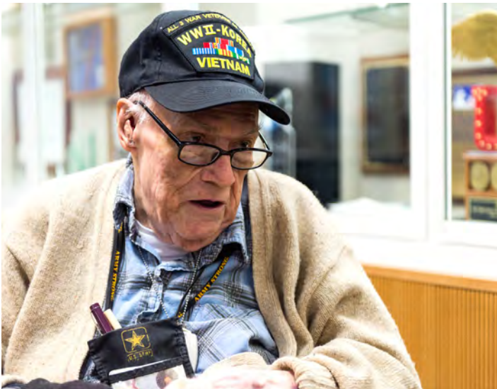
Wheelchairs benefit our nation's heroes