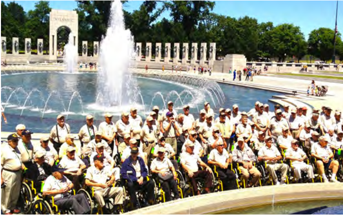
Honor Flight at WWII Memorial