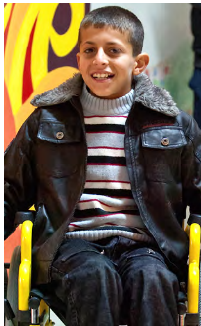
Barra, 12, Princess Basma Center

You can help us cross borders and change lives with the gift of mobility.