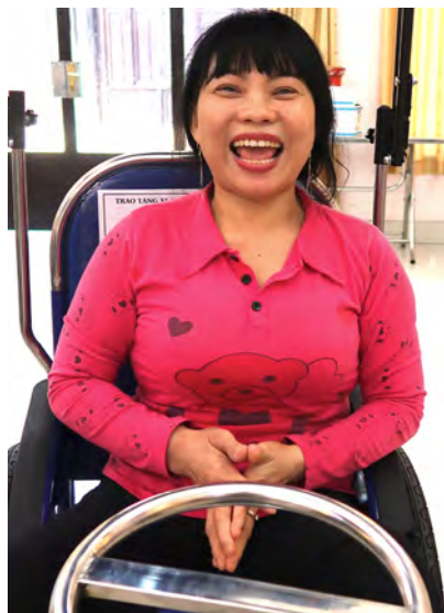
New Mobility in Saigon

It is a life changing experience to visit Vietnam and touch lives in a meaningful way!