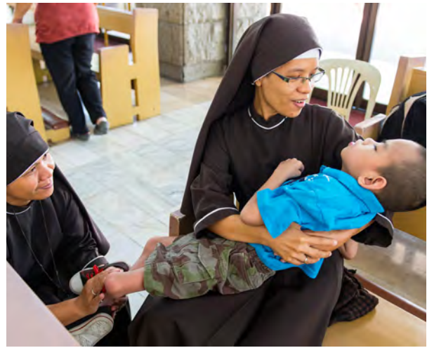
Sisters of compassion in Paranaque