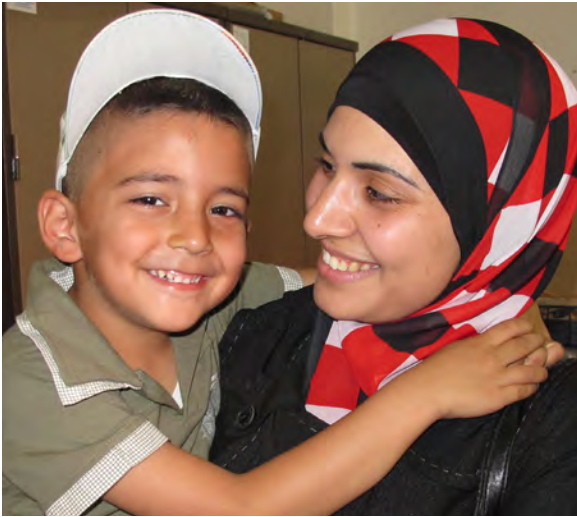
Happy to have a wheelchair