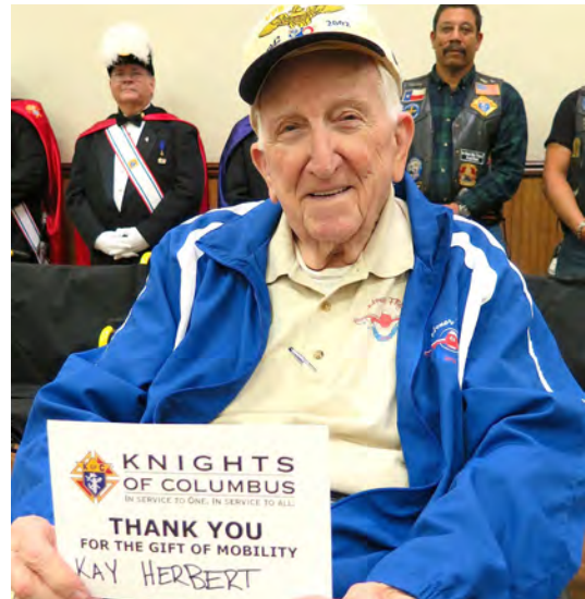
Our wheelchairs go to Honor Flight recipients