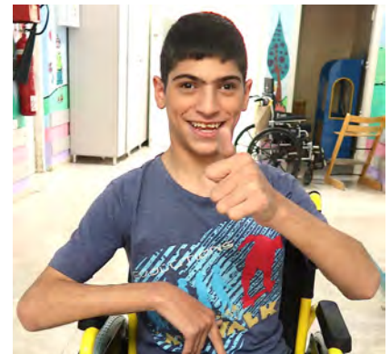
First wheelchair he's owned