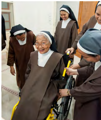
Carmelite nuns in Naga City