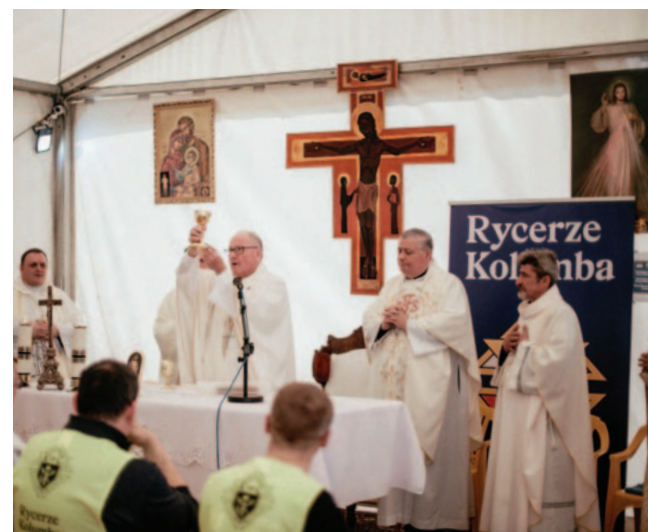
Cardinal Timothy Dolan, Archbishop of New York, celebrates Mass during his visit to the Order's Mercy Center in Hrebenne, Poland, May 2, 2022.