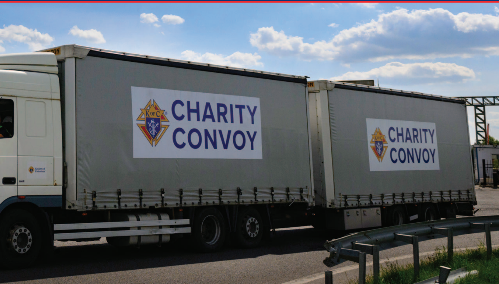
A Knights of Columbus Charity Convoy tandem trailer loaded with care packages for displaced families heads toward Lviv, Ukraine, from the Polish border May 16, 2022.