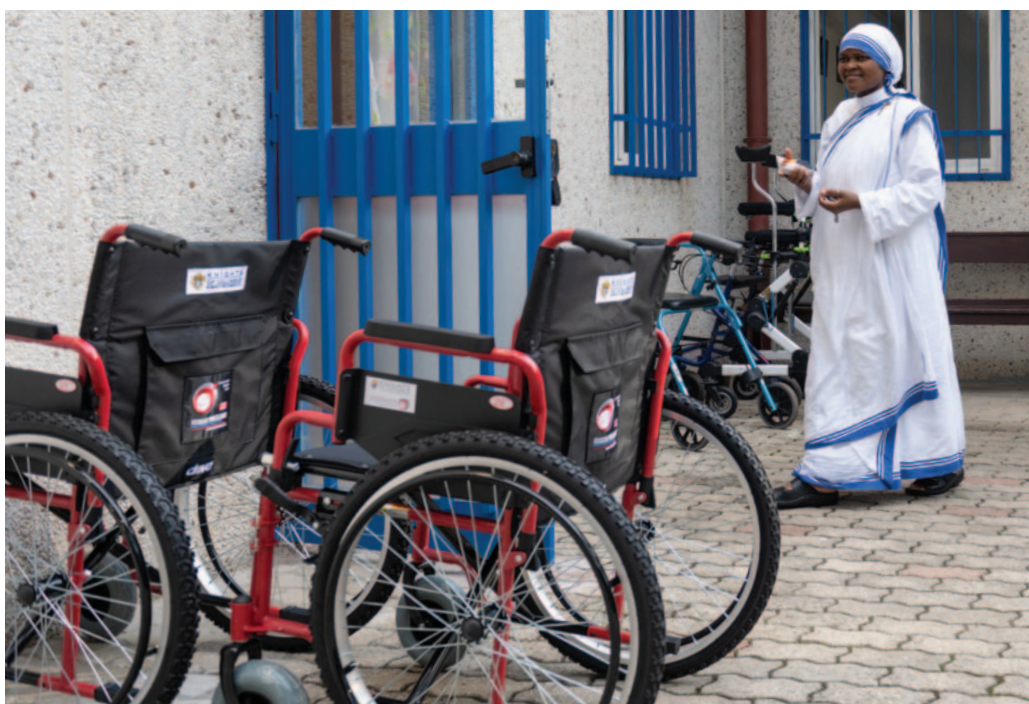
A Missionary of Charity is pictured at the "Queen of Love House" where Mother Teresa's spiritual daughters care for Afghan refugee children in Tor Bella Monica, on the outskirts of Rome.

In my first year as Supreme Knight, I have had some incredible experiences, but none more moving than being with these severely disabled children. Their parents could no longer care for them. They were abandoned on the streets, and the police brought them to the sisters. Even with Kabul falling to the Taliban, the Missionaries of Charity refused to leave without the children.