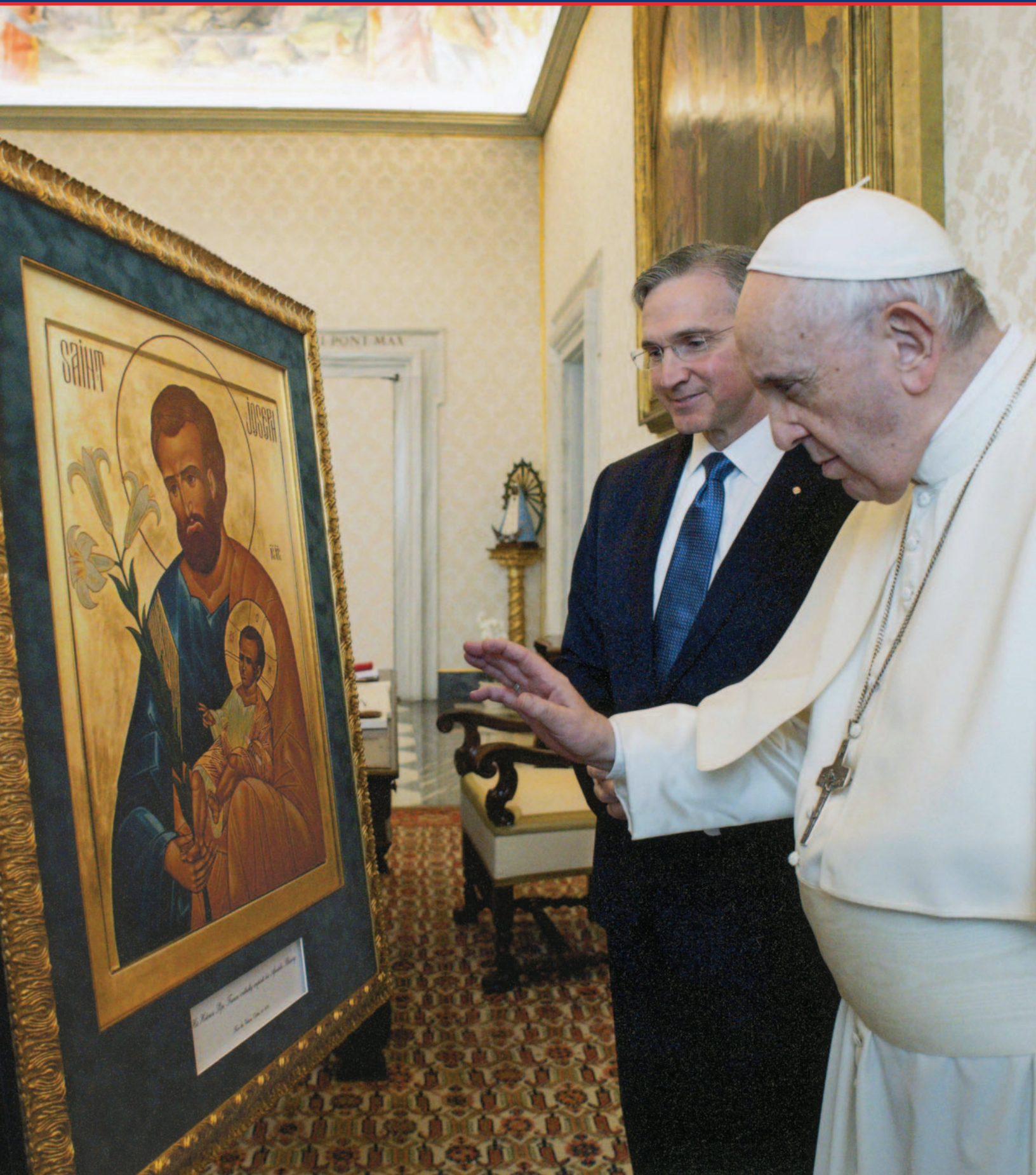
Pope Francis blessed a St. Joseph pilgrim icon that was presented by Supreme Knight Kelly during a private audience at the Vatican on Oct. 25, 2021.