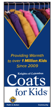
Coats for Kids Trifold (#10503)