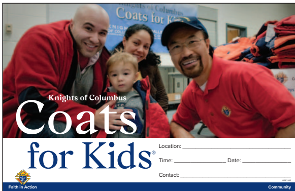
Promotional Poster – Horizontal (#10587)

The Supreme Council offers the below items for order through Supplies Online, the supply ordering portal available on Officers Online.