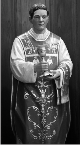
A statue of Father McGivney stands in St. Augustine Cathedral in Bridgeport, Conn., which was part of the Diocese of Hartford during McGivney's lifetime. A first-class relic of Blessed Michael is also encased in the cathedral for veneration of the faithful.