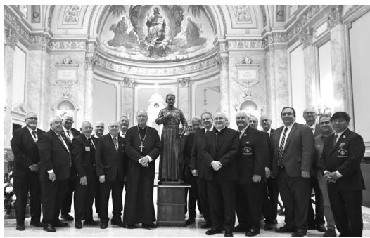
A new statue of Father McGivney was dedicated by New York Cardinal Timothy Dolan in the chapel of St. Joseph's Seminary, Dunwoodie. Joining the celebration were New York State Knights and other K of C officials.

KNIGHTS OF COLUMBUS • 1 COLUMBUS PLAZA • NEW HAVEN, CT 06510-3326