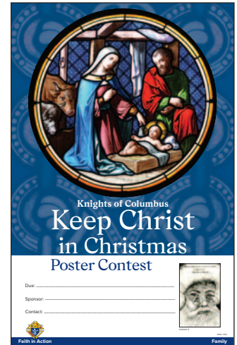
Keep Christ in Christmas Poster Contest Poster (#5026)