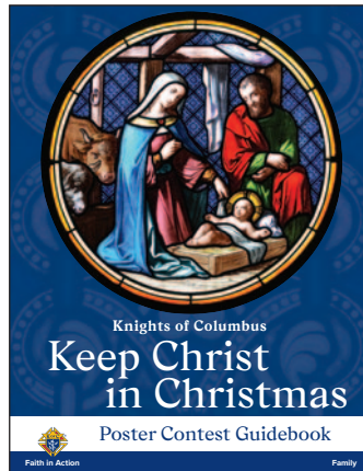
Keep Christ in Christmas Poster Contest Guidebook (#5024)