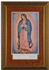
2000-01 Our Lady of Guadalupe