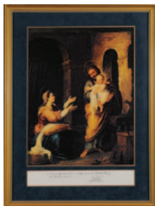
1993-94 Holy Family