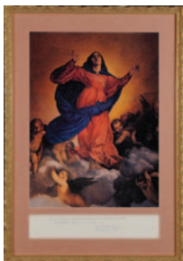
1990-91 Our Lady of the Assumption