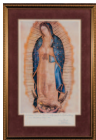
1995-96 Our Lady of Guadalupe