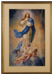
1981-82 Immaculate Conception