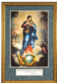
2013-14 Immaculate Conception