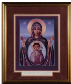
1997-98 Our Lady of the New Advent