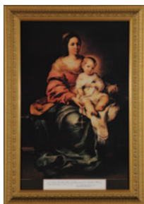
2002-03 Our Lady of the Rosary