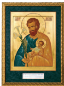
2021-24 St. Joseph