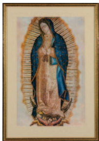
1979-80 Our Lady of Guadalupe