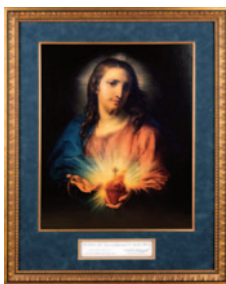
2025- Sacred Heart of Jesus