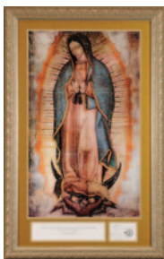
2011-13 Our Lady of Guadalupe