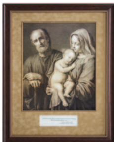
2015-17 Holy Family