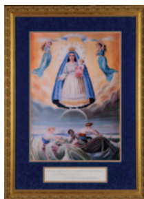
2007-08 Our Lady of Charity