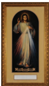
2003-04 Divine Mercy