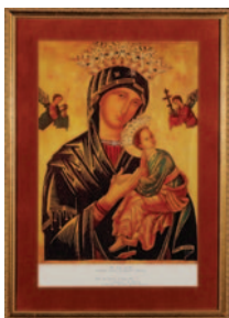
1984-85 Our Lady of Perpetual Help