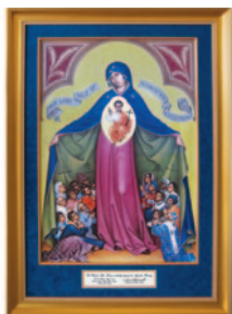
2018-20 Our Lady Help of Persecuted Christians