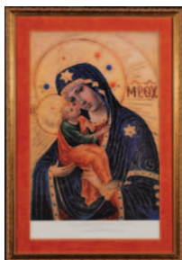
1988-89 Our Lady of Pochaiv