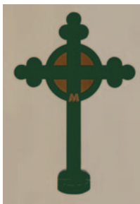
1999-2000 Millennium Cross