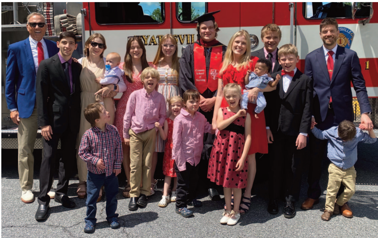
The Ampe Family